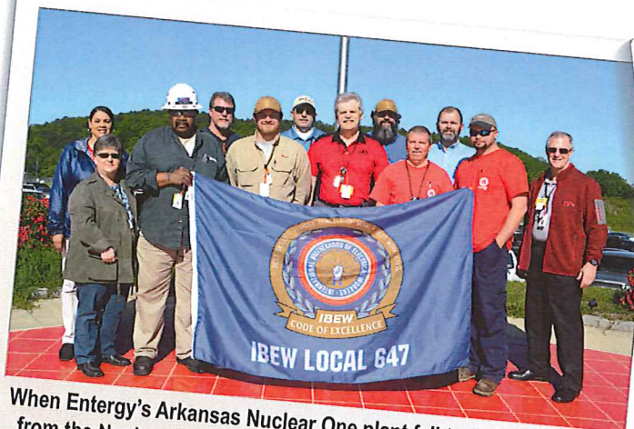
When Entergy's Arkansas Nuclear One plant fell to the lowest rating from the Nuclear Regulatory Commission, the Code of Excellence helped the plant return to safety and success.