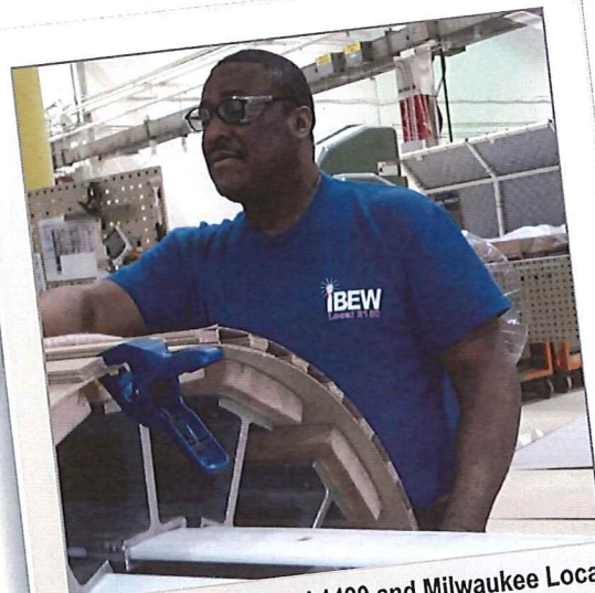
Chelsea, Mass., Local 1499 and Milwaukee Local 2150 used the Code of Excellence as a selling point to bring overseas business back to the U.S. and increased membership along the way.